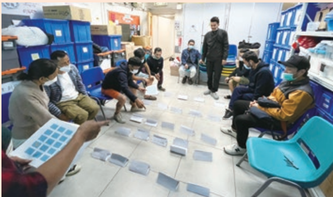
我們在健康支援小組舉辦反思遊戲以提升參加者的戒毒動機。 We organised reflective games in health support group to raise the participants' motivation in entering treatment.