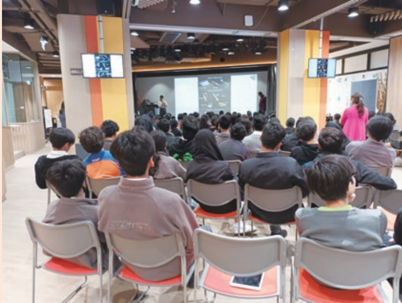
我們向地利亞修女紀念學校(吉利徑)的多元族裔學生推廣抗毒訊息及其影響。 We promoted anti-drug messages and related side effects to ethnically diverse students from Delia Memorial School (Glee Path).