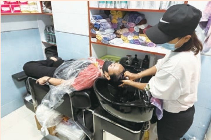
戒毒康復者學習有關美容基礎技巧以準備投入職場及融入社區。 Rehabilitated service users learnt about foundation skills for beauty to prepare for work and integrate into the community.

The project continues to strengthen the strategy for the mothers' target group by achieving the "snowball effect" through recruiting peers supporters and carrying out attractive activities to increase their motivation to join the rehabilitation strengthening programmes. The target groups aimed at building up their mutual support network, teaching them skills to deal with life pressure and enhancing their problem-solving ability. In the middle phase of the group, we used art, horticultural therapy and sports as means of group intervention to help them develop relaxation skills, improve body-mind-spirit level and strengthen motivation to maintain abstinence. We collaborated with different NGOs for rehabilitated mothers to help them integrate into the community and broaden their social resources.