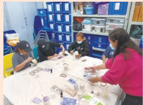
母親小組成員學習製作乾花擴香石，發揮其設計天份並學習情緒管理。

Service users from mothers' group learnt to make dried flower aroma stones for developing their design talents and learning emotional management.