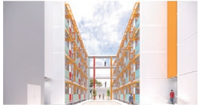
「善樓」過渡性房屋 (*構想圖) "Good House" (*Rendering)