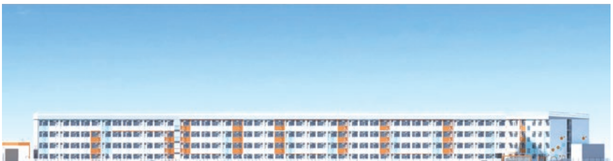
「善匯」過渡性房屋 (*構想圖) "Good Mansion" (*Rendering)