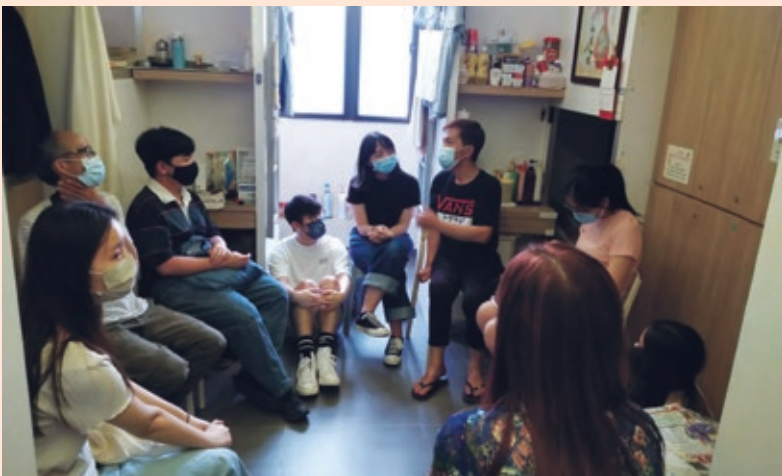
油麻地蘇屋與香港社會工作學生聯會於二零二二年五月合辦了一場工作坊暨分享會。 Collaborated with the Hong Kong Federation of Social Work Students, a workshop and sharing session was organised in So Uk, Yau Ma Tei in May 2022.

In the past year, the "So Uk" Project continued to regularly hold online and offline activities, workshops, and gatherings on various themes, with the aims of developing residents' physical and mental health, encouraging them to seek personal growth, promoting mutual exchange and support among residents, and establishing interpersonal and community support networks.